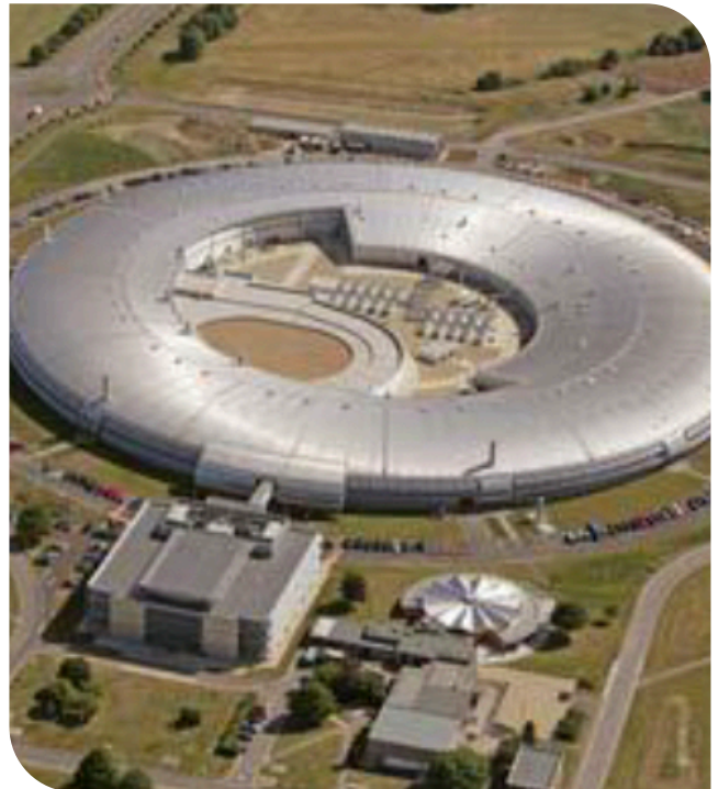
Figure 1: Aerial view of Diamond Light Source

Diamond Light Source, the synchrotron complex on the Harwell Science and Innovation Campus, produces x-ray, infrared and ultra-violet beams of exceptional brightness. These highly focused beams of light are enabling scientists and engineers to probe deep into the basic structure of matter and materials, answering fundamental questions about everything from the building blocks of life to the origin of our planet. When Diamond opened in 2007, seven cutting edge experimental stations, called 'beamlines' were operational. Four more are now operational, with an additional 11 in various stages of construction and optimisation, bringing the total of operational beamlines to 22 by 2012.